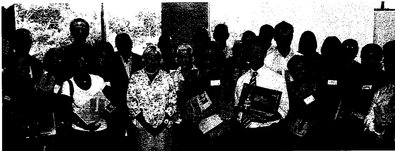
▲ Group photo of all grant recipients at 2009 grants presentation night.

Over seventy guests from key community groups attended the Kew East Community Bank ® Branch 2009 grants presentation night. In total almost $122,000 of grants were presented on this night with a broad range of projects receiving funding. The following snapshots provide insight into how these projects are progressing.